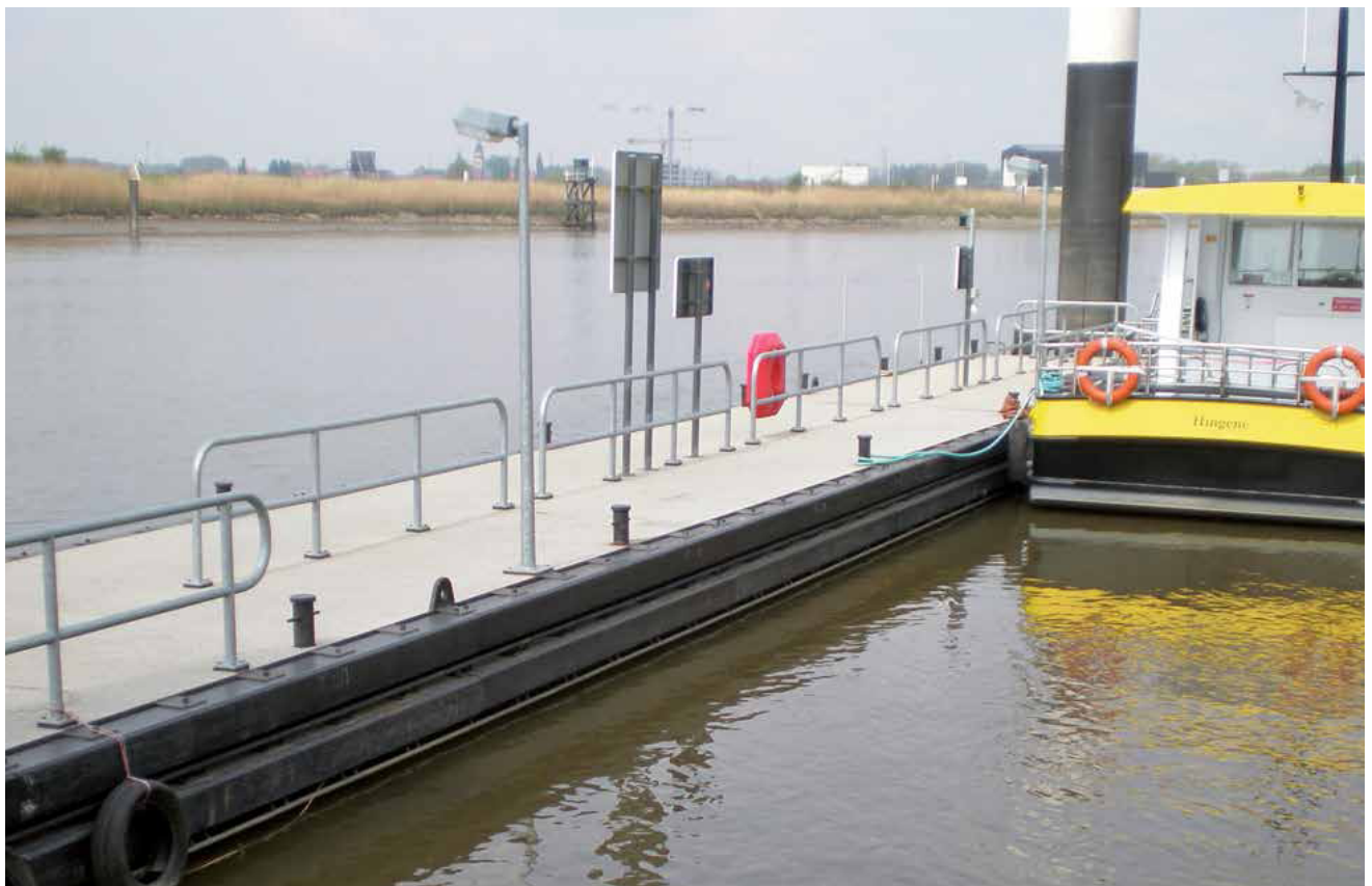
Potoon Schellebelle | Wintam | Belgium

Machining is done at 18° C | Thermal expansion should be taken into consideration if installation is done at different temperatures