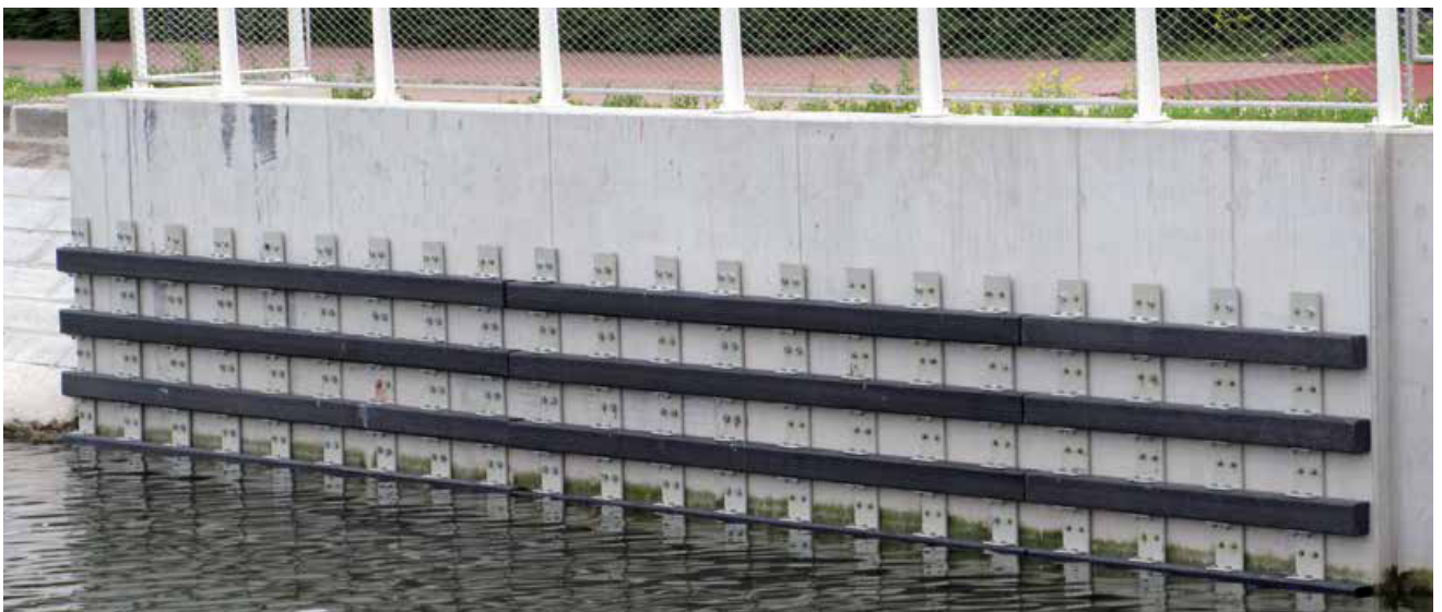
Scheepsdalebrug Kanaal | Gent | Belgium

* Allowance for cross-sectional tolerances of \pm 4 % | Planing optional to reduce plus tolerances