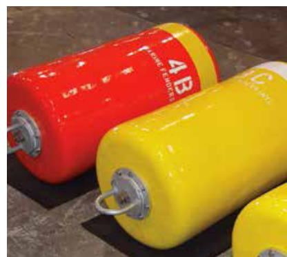
Utility Cylindrical Buoys