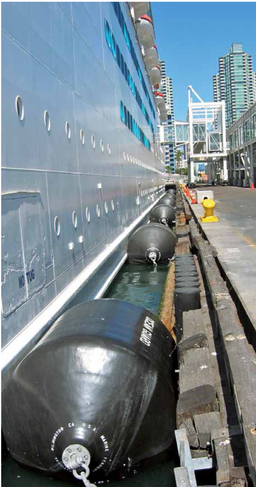
B Street Cruise Ship Terminal | San Diego, CA | USA