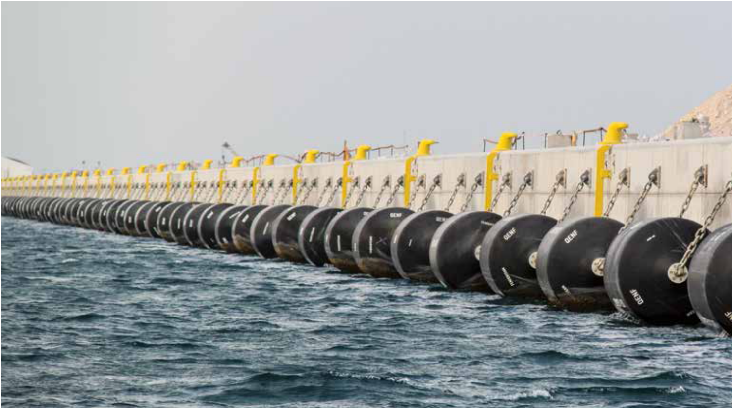
Naval Base | Doha | Qatar