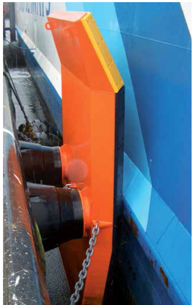
Ferry Terminal | IJmuiden | The Netherlands