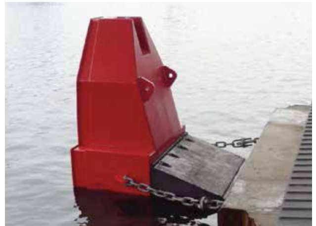
Ferry Terminal | Rostock | Germany